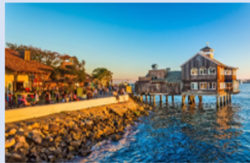
Seaport Village in San Diego