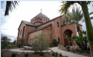
St. Sarkis Armenian Church of San Diego

Bus will Leave Church Lot at 9:00 a.m. 2215 E. Colorado Blvd. Pasadena 91107